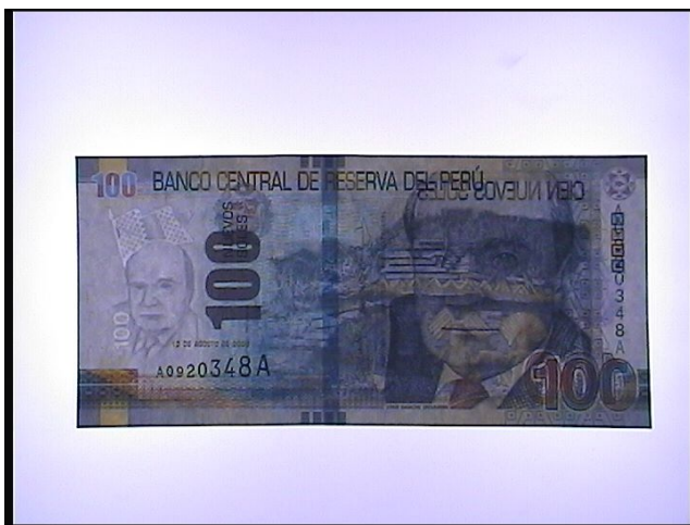
White bottom light