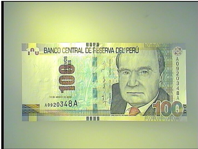
White oblique light